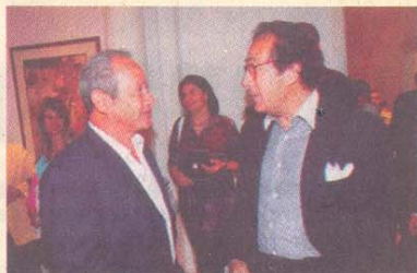
Naguib Sawiris and Farouk Hosni.