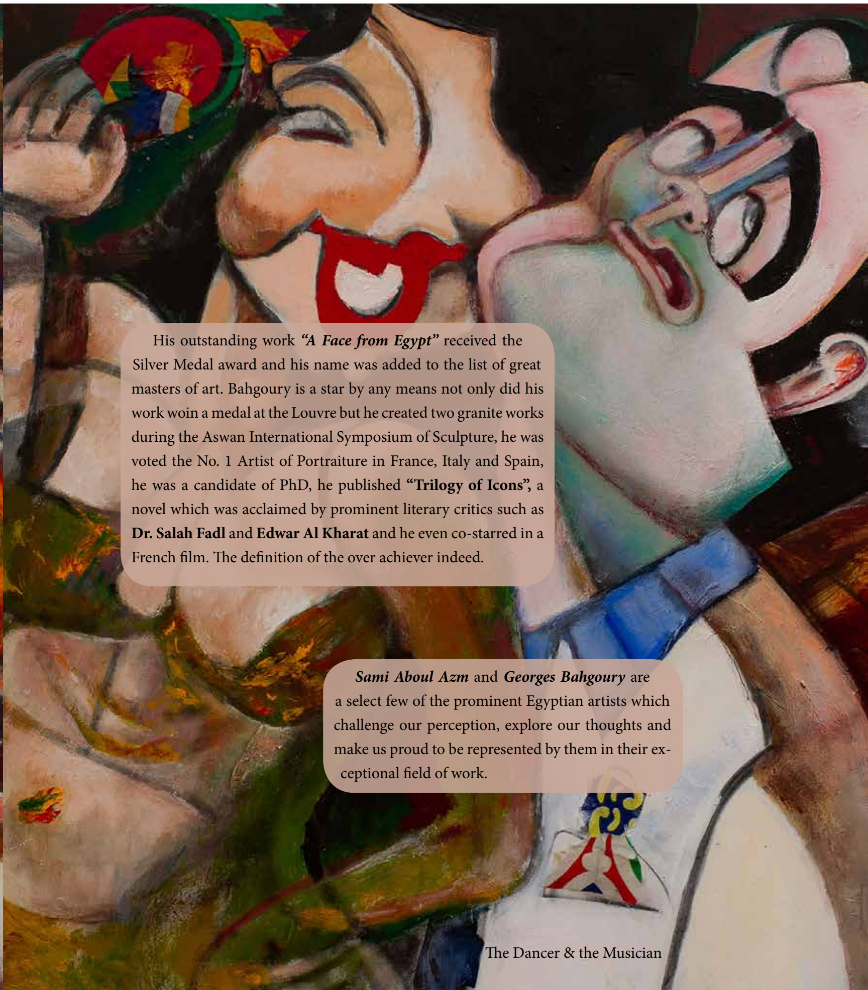
The Dancer & the Musician