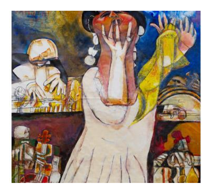
"Singing from Heaven I," oil on canvas (2011)