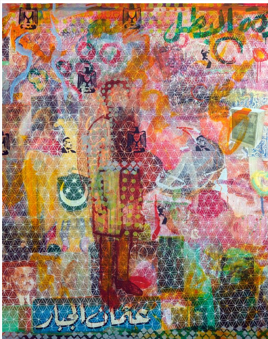
Hazem Taha Hussein, Othman El Gabbar, Mixed Media on Canvas , 145 x 160 cm – 2013.

ALSO READ: With His Art, Taha Hussein Evokes the Rich Cultural Relationship Between ‘East and West’