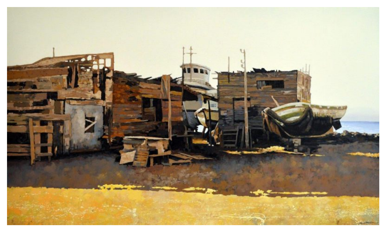
Sami Aboul Azm, The Old Sea Road II, Oil on Canvas, 200 x 120 cm, 2022, © Al Masar Gallery

Places often have their own context, their own inner energy, inducing excessively deeper memories. Such is not meant to be captured, but rather the yearning to search for the familiar or usual in a memorably common scene, or in another thought; is the dismantling of reality so the scene thus becomes more alienated, isolated and lonely.